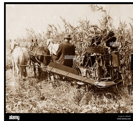
Harvesting in the 1900s