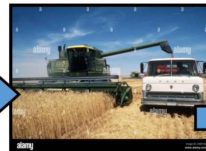
Harvesting in the 1980s