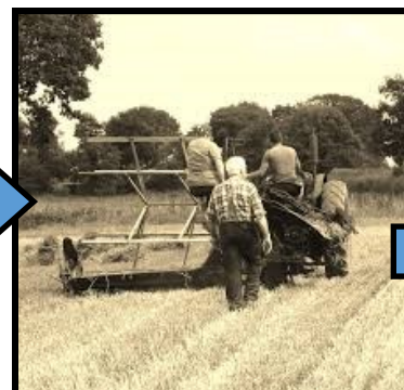
Harvesting in the 1950s