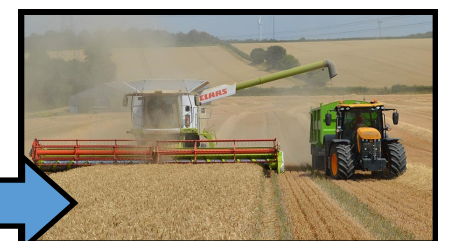
Harvesting in 2020